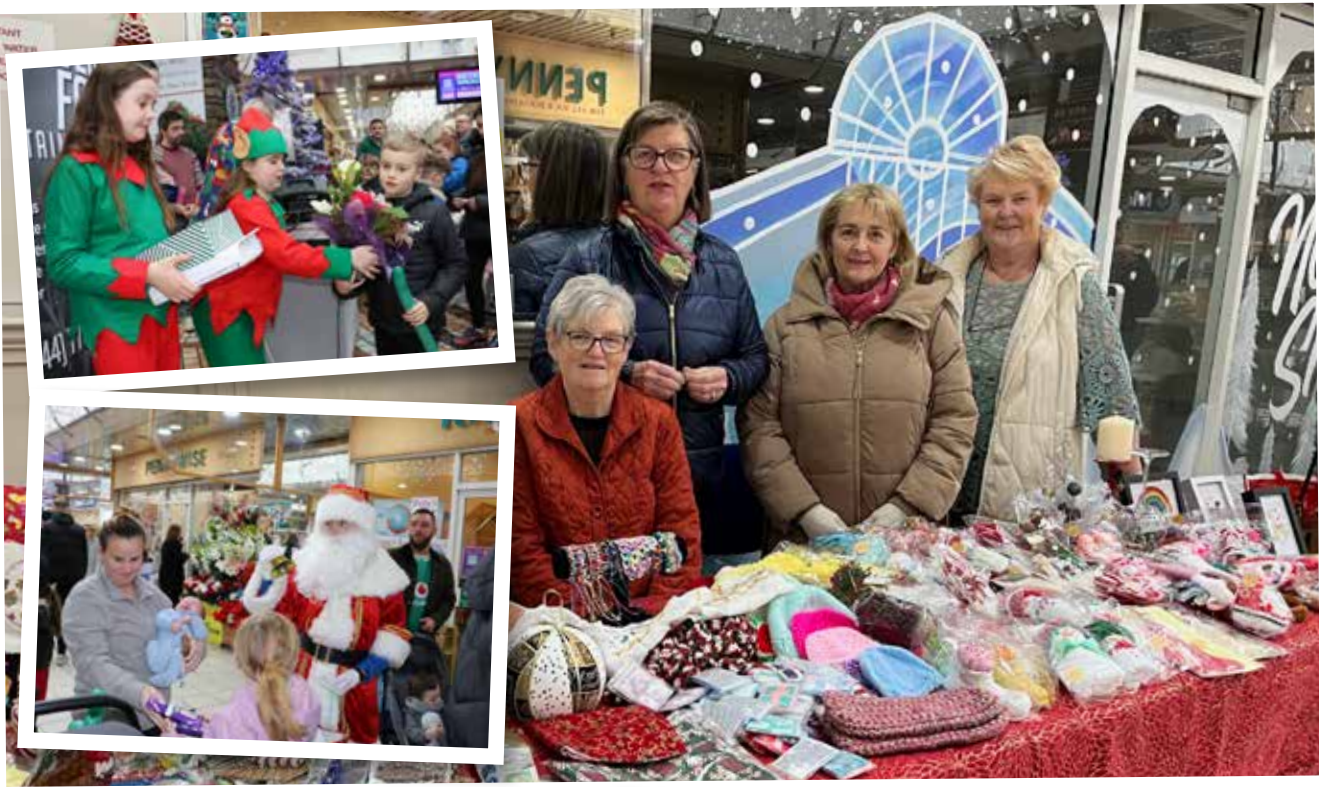
Christmas crafts & funday, 2024.