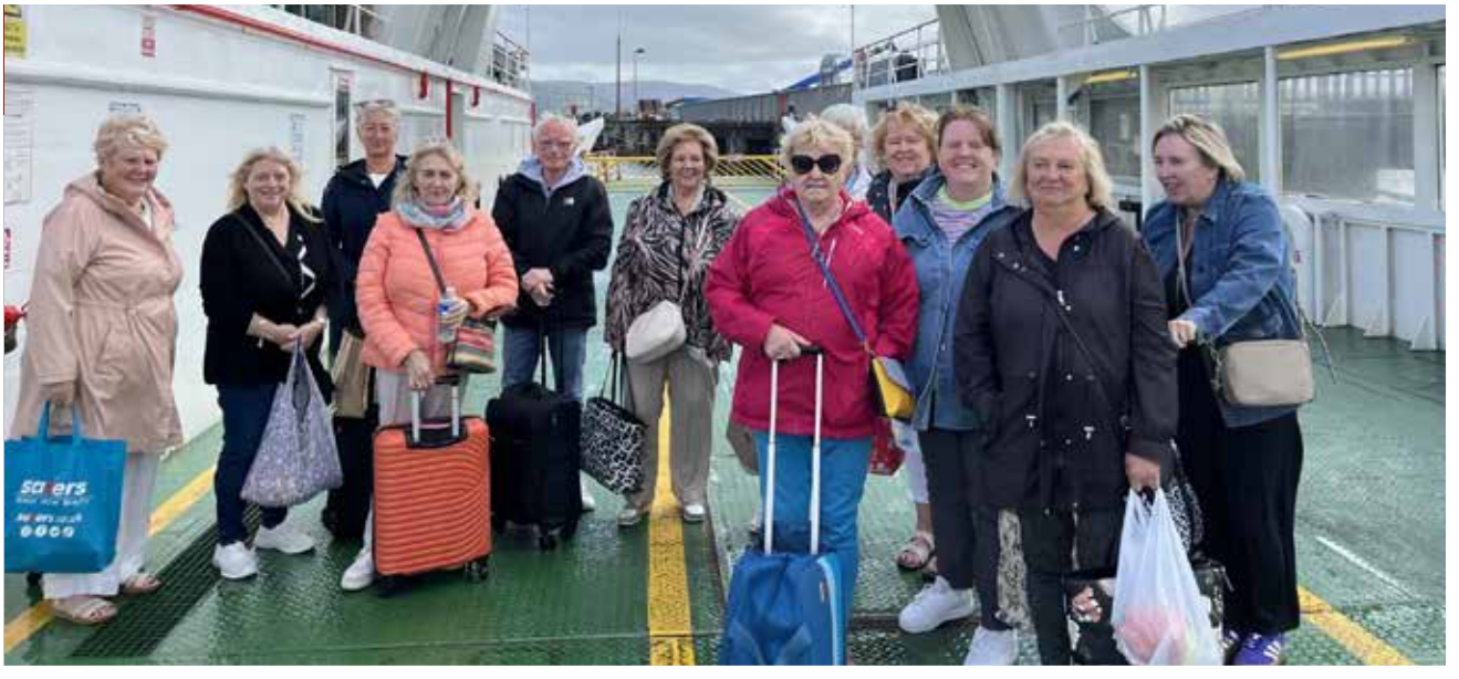
CCRP activities/events, 2024.