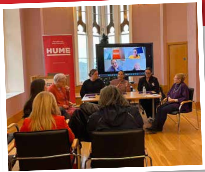
Focus activities/events, 2024.