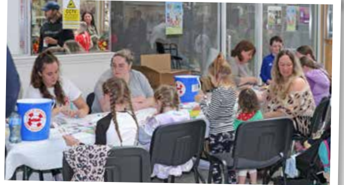
Summer Family Funday, 2024.