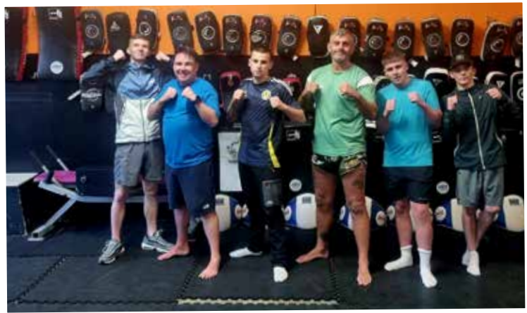
Lifehack activities/events, 2024.