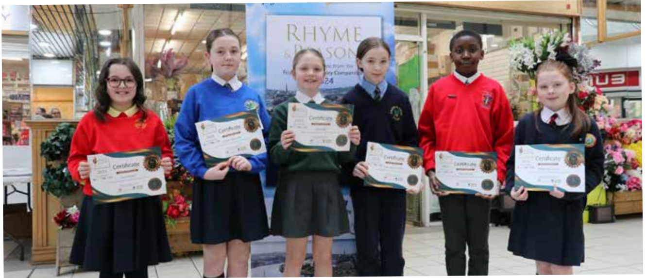
Images from the Foyle Schools Poetry Competition Awards Ceremony, Ráth Mór, 2024.