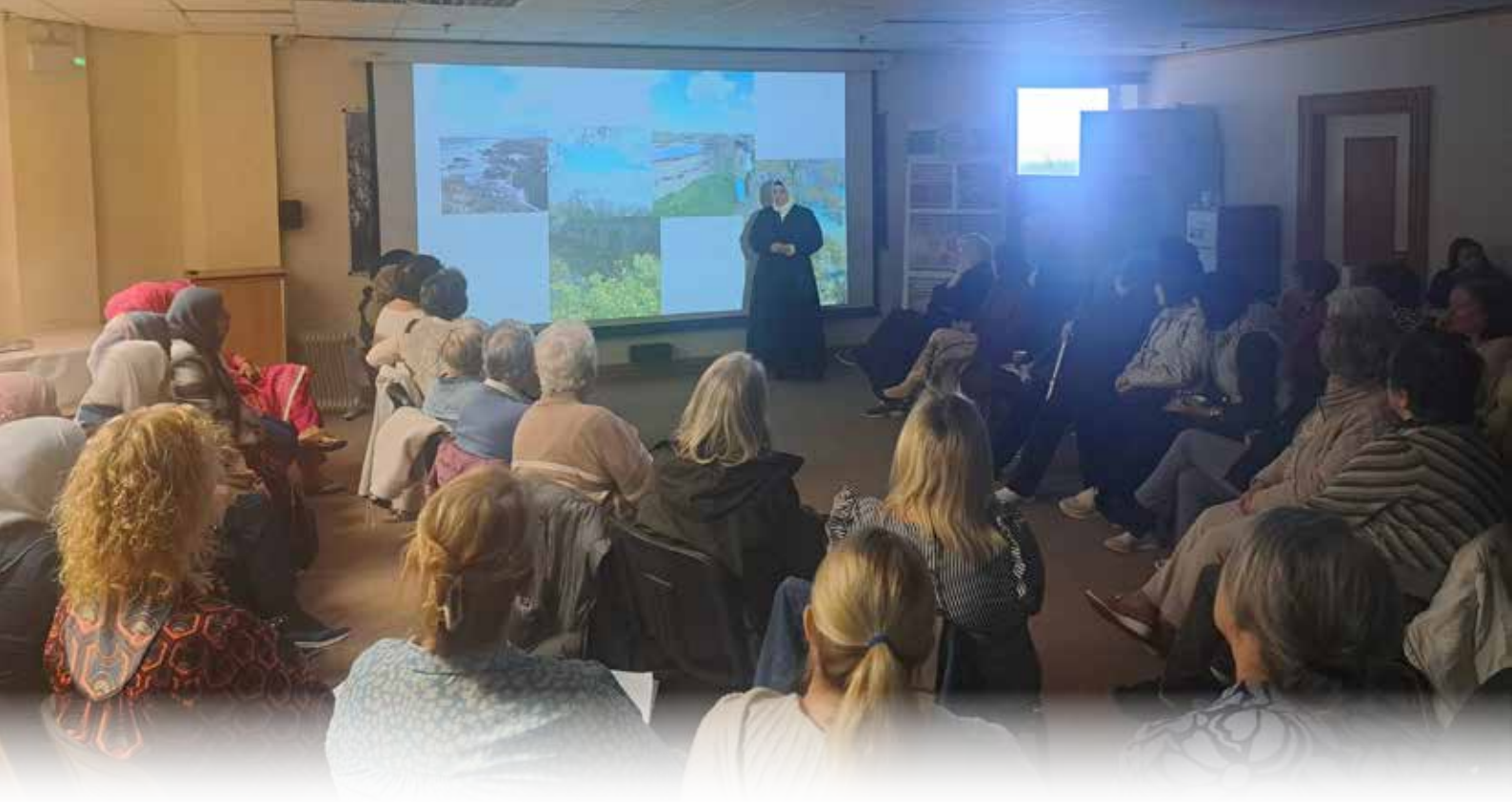
Revival activities/events, 2024.