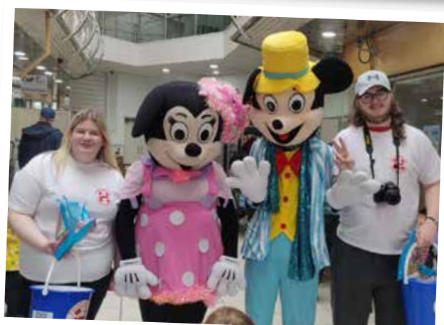
Summer Family Funday, 2024.