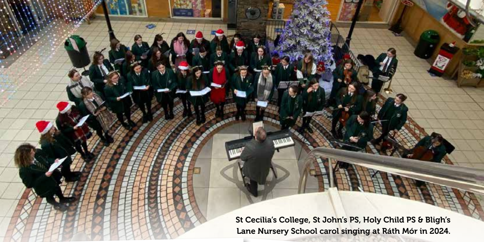
St Cecilia's College, St John's PS, Holy Child PS & Bligh's Lane Nursery School carol singing at Ráth Mór in 2024.