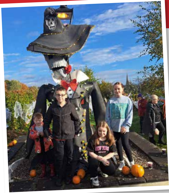
Halloween Family Pumpkin Patch, 2024.