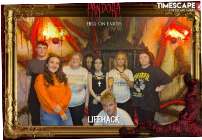
Lifhack activities/events, 2024.