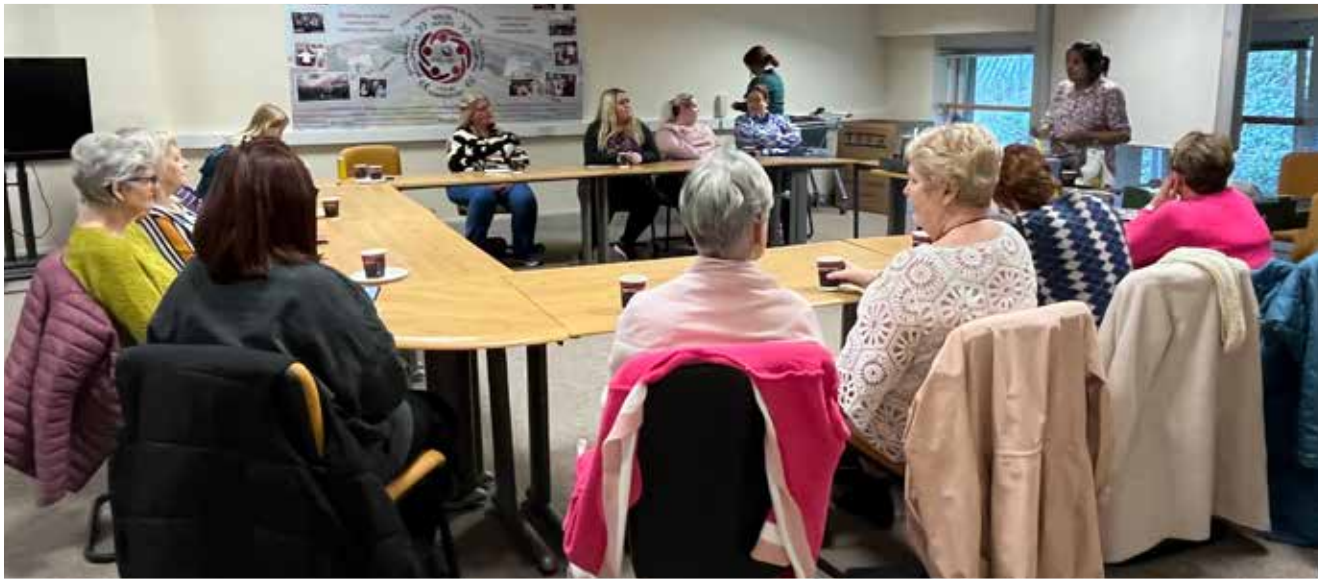
Revival activities/events, 2024.