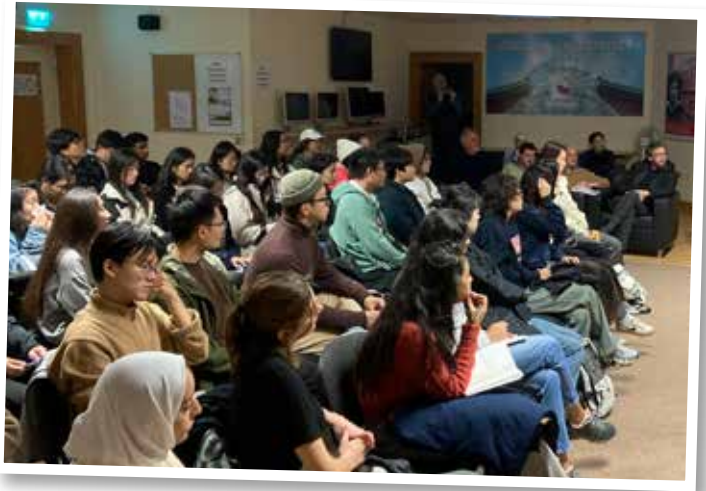
CIP activities/events, 2024.