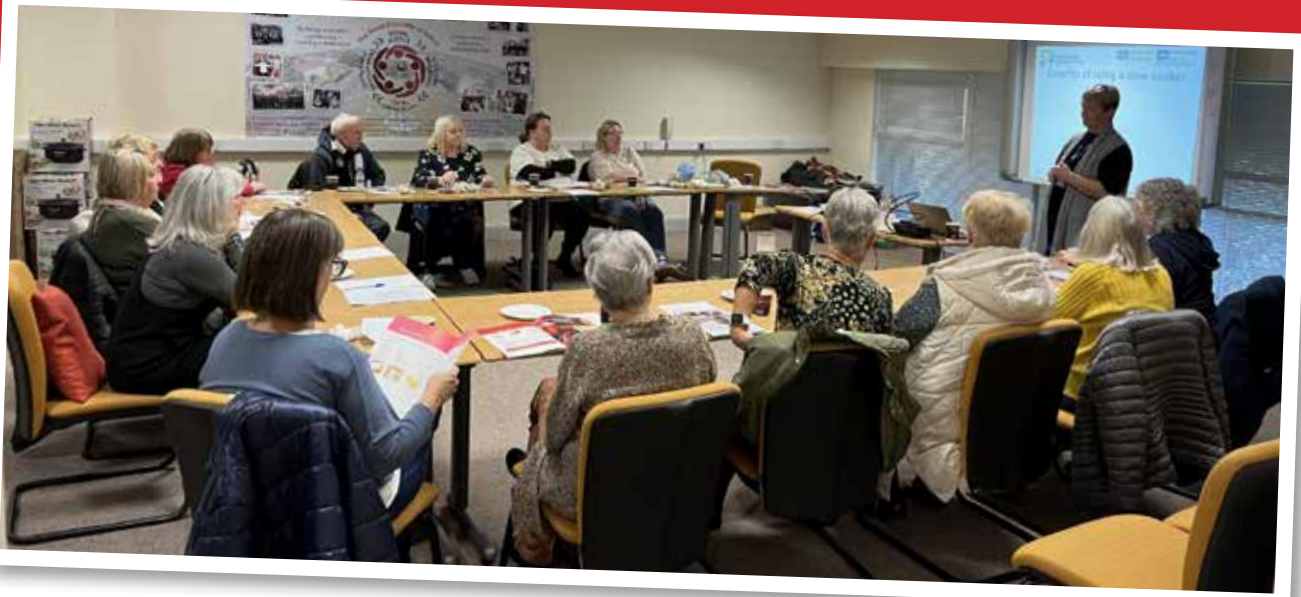
CCRP activities/events, 2024.